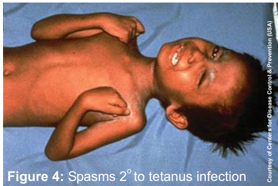
Figure 4: Spasms 2° to tetanus infection

The diagnosis of tetanus is based on the clinical signs and symptoms only. Laboratory diagnosis is not useful as the C. tetani bacteria usually cannot be recovered from the wound of an individual who has tetanus, and conversely, can be isolated from the skin of an individual who