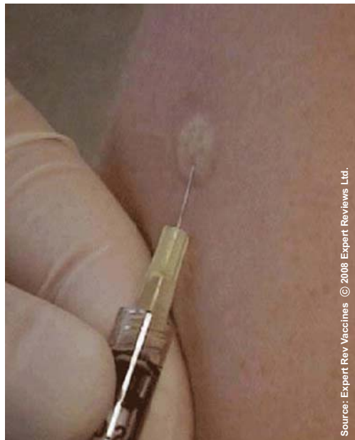
Figure 8: Intradermal administration of the BCG vaccine

General reactions are rare and mostly consist of lymph adenitis with or without suppuration and discharge. Very rarely a lupoid type of local lesion has been reported.