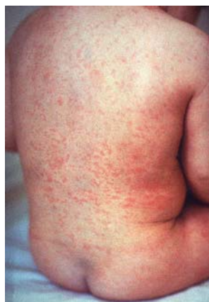
Figure 7: Generalised maculopapular rash in rubella

The incubation period is 14 to 21 days and the period of highest infectivity is from one week before until 7 days after the onset of the rash.