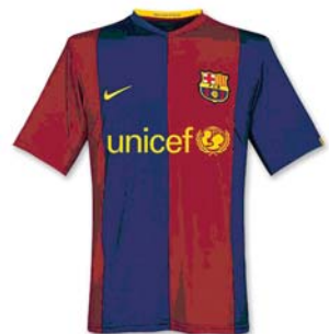
Figure 2: Barcelona Kit – FC Barcelona donate money to UNICEF for this 'advert' whilst other clubs (with the exception of Aston Villa FC that donates to the ACORNS children's hospice) get paid for adverts on their kit.

The United Nation's Children's Fund (UNICEF) promotes the delivery of safe and effective vaccines especially in developing countries. This UNICEF initiative is partly financially supported by the European football giants FC Barcelona as can be seen in Figure 2.