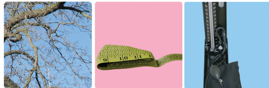
Stop Stroke Fast