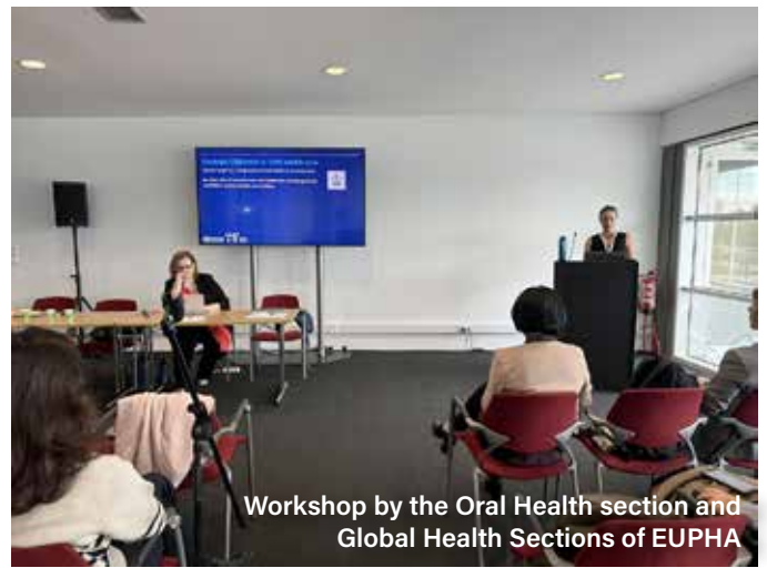
Workshop by the Oral Health section and Global Health Sections of EUPHA